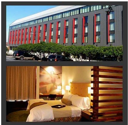
Hotel Indigo Athens University Area is open now, with rooms from $127