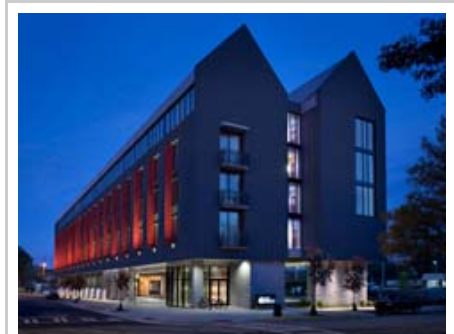
The Hotel Indigo Athens was designed to reflect the covered bridges that span local rivers.