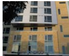
Hotel Indigo San Diego – Gaslamp Quarter.

brand's commitment to the environment, sustainable green building and development practices were incorporated into the design, construction and operation of the new 12-story hotel. Another first for the brand and the city the hotel is topped with a green roof on the ninth and 12th floors. The green roof, which is covered with drought-tolerant plants, will reduce energy consumption by cutting the need for heating and air conditioning and will contribute to lowering the urban heat island effect. The Hotel Indigo San Diego – Gaslamp Quarter recently received two prestigious awards from the Georgia chapter of the American Society of Interior Designers (ASID): the Silver Award for "Sustainable Interior Design" and the Bronze Award for "Hospitality Interiors Under $80k per square foot."